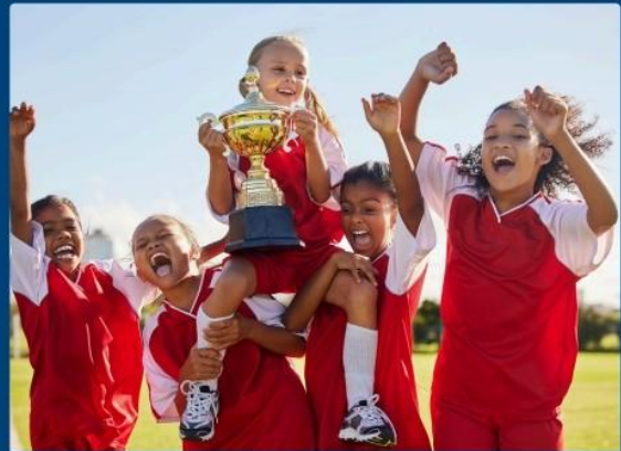
Trophy awarded to the Junior and Senior player of the day