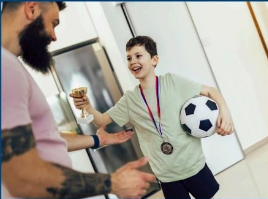
A medal given to every player taking part in the tournament