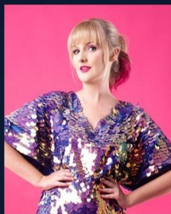
TAYLOR SWIFT TRIBUTE 19 February