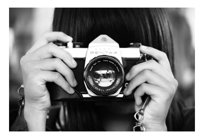
Photo order cards came home this week with your child, these contain all the details needed to place an order for your child's individual and/or sibling photo. Order by 20th November for free delivery to the school. Orders after the cut-off date will incur a P&P charge.