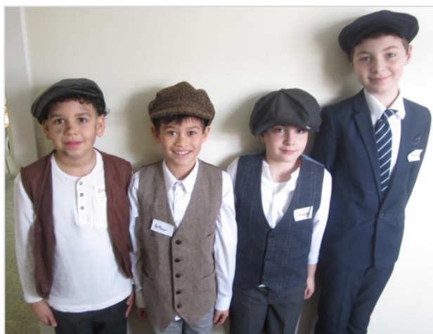
YR5 Victorian Day 09.02.22