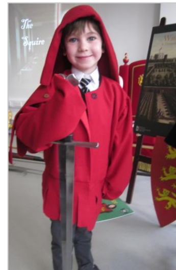
YR1 at Windsor Castle