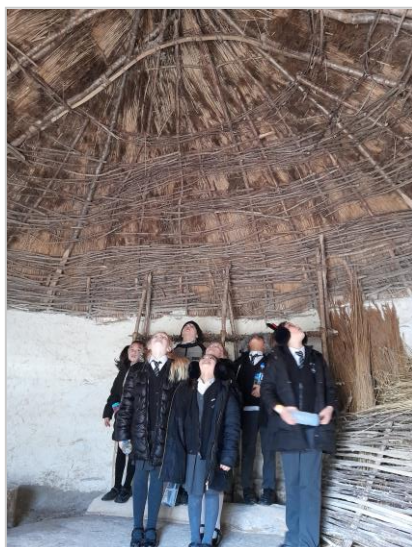
YR3 Stonehenge Trip

The Friends of Richmond Park Discoverers section has teamed up with Holly Lodge Education Centre to offer a free half-term trail for children to take them on a journey all about trees in winter. There will be hands-on activities and at the end of the trail, children will have the opportunity to make a paper pot and plant a tree seed for them to take home and look after. Drop in between 10m and midday on Thursday 17 February. Meet at the entrance of Pembroke Lodge. Wheelchair and buggy accessible. www.frp.org.uk/discoverers