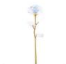
Crystal Effect Rose