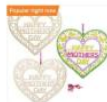
'Happy Mother's Day'