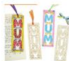
Bookmark craft kit