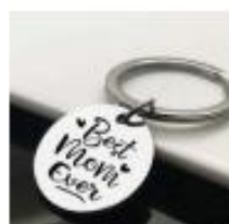
'Best Mom Ever'