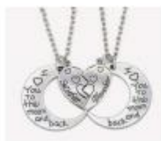
Mother Daughter double pendant