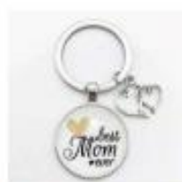
'Best Mom Ever'